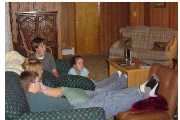
Relaxing on the spacious living room