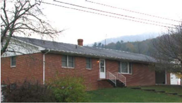
CircleRock Retreat Center

Listen, pray, walk, read, think, dream, heal, respond . Be!