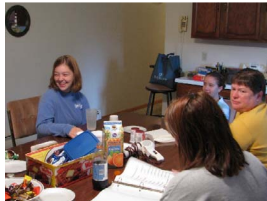
Fellowship in the country kitchen

The facility may be used by our guests at no cost to them. All donations will be used to cover basic costs such as heating, electricity, and laundry. Any gifts for this ministry are appreciated.