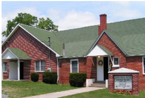
Circleville Presbyterian Church

CircleRock's setting is the Presbyterian manse located across the street from the Circleville Presbyterian Church. It is a fully furnished spacious house, built in the early 1980's, with a large living room and eat-in kitchen, 5 bedrooms with beds for up to 16 people, three full baths, a large open room in the basement, and a new deck.